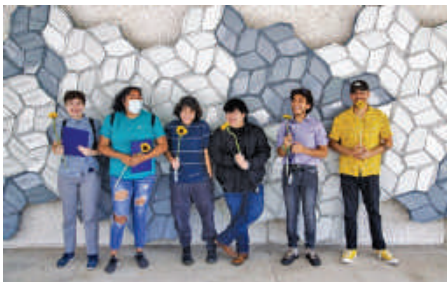
Graduates of the 2022 Caminos program.

Over half of this year’s graduates plan to continue working at the ESB MACC in different capacities, from graphic designers and event assistants to mentors for the 2023 class of Caminos teens, who are currently being interviewed.