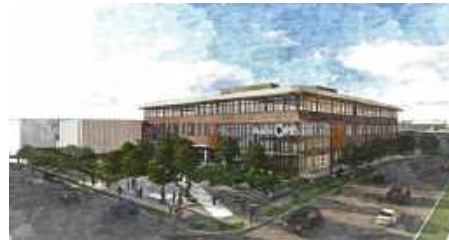
Austin PBS invites the local community to a grand opening celebration of its new home at ACC Highland.

Families can experience all that the Austin Media Center has to offer with kid-focused activities (indoors and outdoors), live music performances, interactive learning lounges, food and drink, community dialogues and more PBS Kids characters!