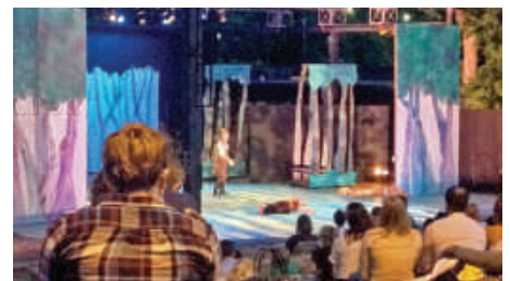
Volunteers are needed to set up for Zilker Hillside Theater performances.

Benefits of volunteering include a free parking pass and a saved seat to watch the show. For more information, go to austinallies.org/calendar .